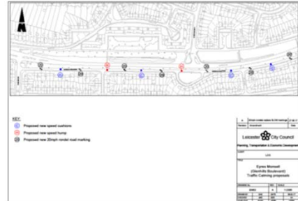
Glenhills Boulevard – Proposed Traffic Calming