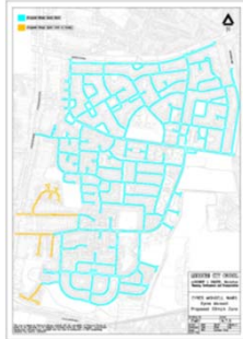
Eyres Monsell - Proposed 20MPH Scheme